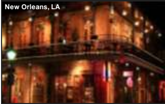
New Orleans, LA

Get ready to be transported to a world of tropical beauty as you cruise south for the winter. Set sail from the birthplace of jazz to Harvest Caye in Southern Belize, The Caribbean's premier island destination. Here you can enjoy an exclusive 7-acre beach and exciting shore excursions ranging from zip lining across the island to snorkeling the world's second largest barrier reef. In Honduras, Roatán is a peaceful, eco-tourist dream. Experience the unique sights and turquoise waters of Tabyana Beach & interact with monkeys and macaws at Gumbalimba Park.