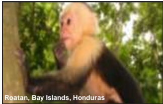
Roatan, Bay Islands, Honduras