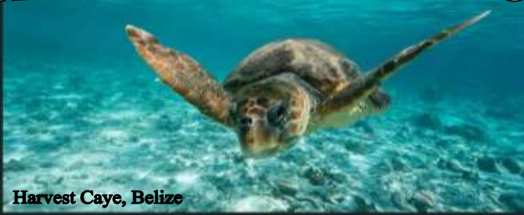
Harvest Caye, Belize