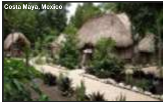
Costa Maya, Mexico