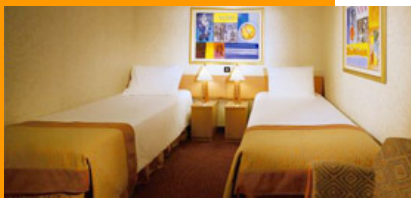
Inside: $729.00/person Cat. 4B