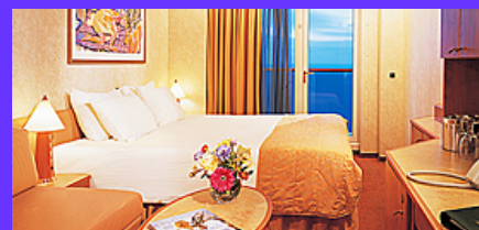
Balcony - Starting at $1,279/person based upon double occupancy