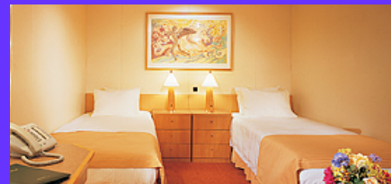
Interior - Starting at $1,019/person based upon double occupancy