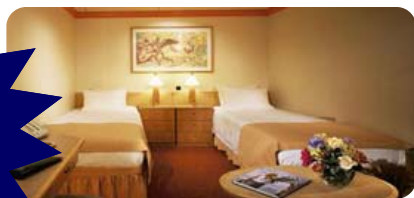
Interior Starting at $1,099/person Cat. 4B