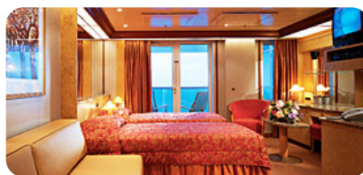
Balcony Starting at $1,305/person Cat. 8B

For more information please contact Renee: